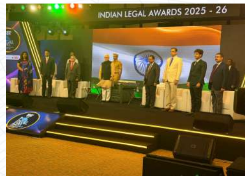
The chief guest and key dignitaries during the National Anthem