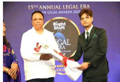
Niles Tribhuvann welcoming Shri Ashish Shelar, Minister of Cultural Affairs of Maharashtra